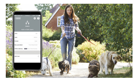
Let the dog walker in. Schedule recurring access.