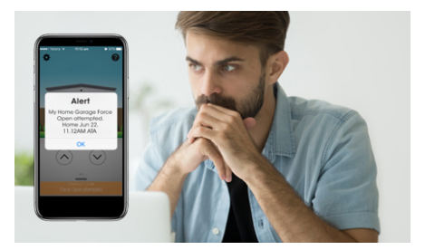
Stop worrying. You will get an alert if you have left your door open.