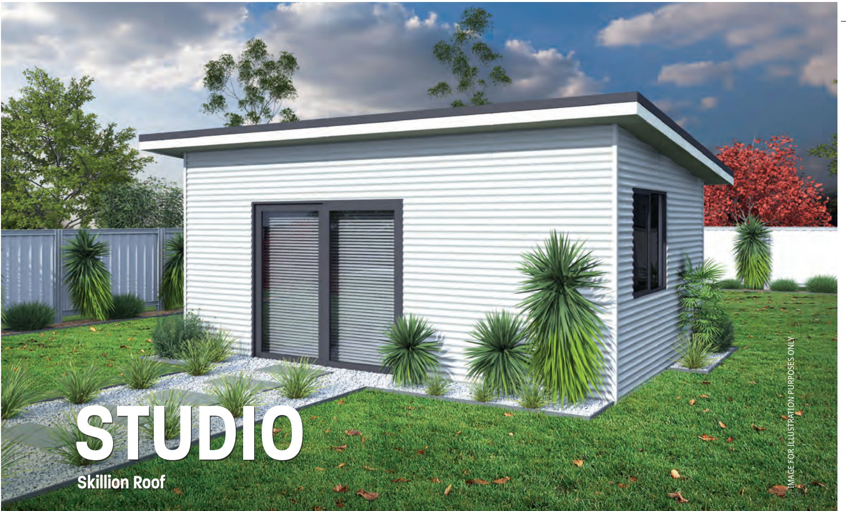
IMAGE FOR ILLUSTRATION PURPOSES ONLY